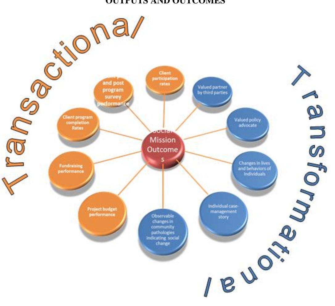
FIGURE 1 SYSTEM OF TRANSACTIONAL AND TRANSFORMATIONAL OUTPUTS AND OUTCOMES

Figure 1 illustrates the interplay transactional and transformational social outputs may have in a system of social enterprise outcome measures. Because proof of social enterprise outcomes is likely to be in the eye of the beholder - who in many cases has provided the financing for a particular endeavor - the original intentions and mission statement of the entrepreneur offer a good starting point for social change achievement goals (Sheehan, 2010, chapter 1; Katzer, Light, 2004; Cook & Crouch, 1991, introduction). It is also useful for social entrepreneurs to articulate their envisioned end-products during the planning phase of the social enterprise endeavor.