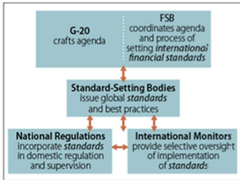
FIGURE 2 INTERNATIONAL FINANCIAL REGULATION ARCHITECTURE