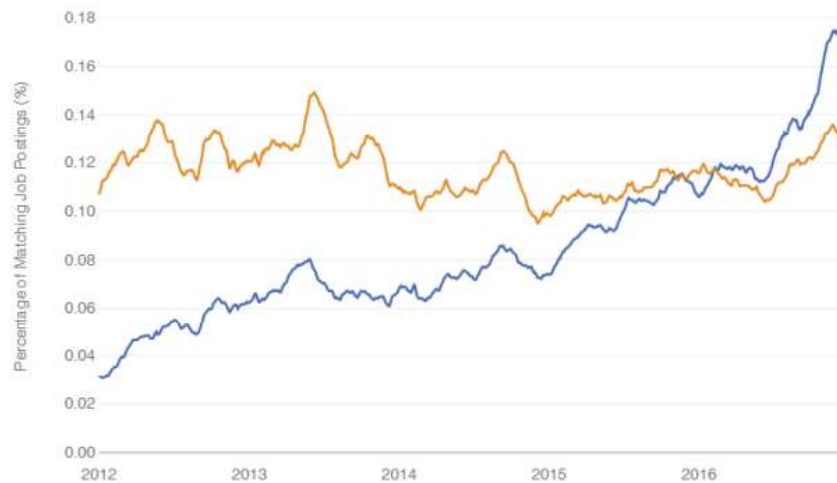
FIGURE 3 THE JOB POSTING TRENDS FOR PYTHON (ORANGE) AND R (BLUE)