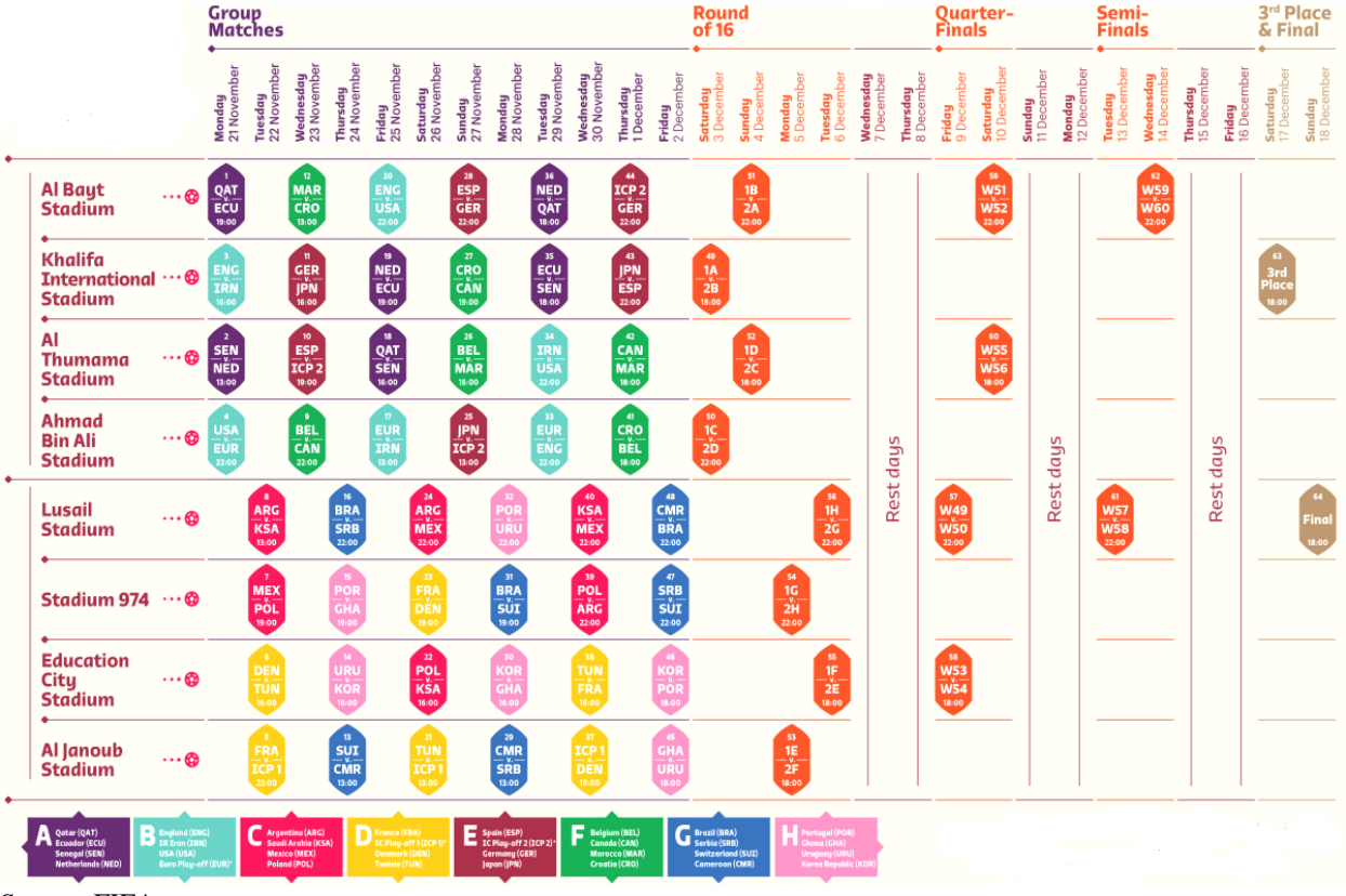
FIGURE 1 MATCH SCHEDULE FOR THE 2022 FIFA WORLD CUP IN QATAR