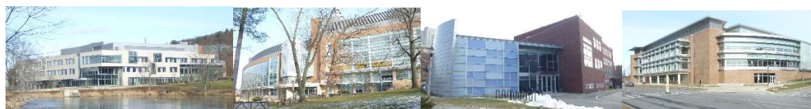
FIGURE 2 OPTIMAL CONSTRUCTION TOUR TIMING (PHOTO USED BY PERMISSION)