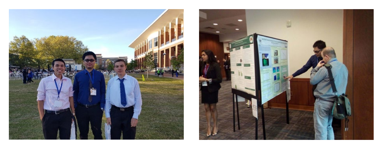
FIGURE 3 PICTURES OF THE PARTICIPATION OF THE JIC PANAMA 2016 WINNERS AT THE NATIONAL CONFERENCE ON UNDERGRADUATE RESEARCH 2017 – UNIVERSITY OF MEMPHIS