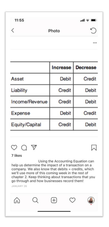
FIGURE 3 ACCOUNT POSTING WITH ANSWERS TO STORY QUESTION

Once the activity has been completed, I posted to the account a summary of what we had discussed and what they should know about this concept. Unlike stories, this information stays visible to the student for reference later. This post stays posted in my profile. In this example, I had asked about what kinds of accounts increase as debits or credits. After the activity, I posted this summary for students to view, like, and comment.