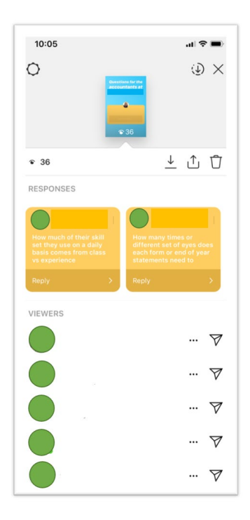
FIGURE 4 THE USE OF POLLING FOR STUDENTS' QUESTIONS FOR ACCOUNTING PROFESSIONALS

Before going to interview some local accounting professionals, I posted a poll in my stories. This poll asked the students if they had any questions they wanted me to ask the accounting professionals. You can see at the very top of the page what was posted to my story. At the bottom of the page, I can again see who has viewed the story. The boxes in the middle of the page are some of the students' responses. They had replied to the poll with questions they wanted me to ask the accounting professionals. It is all compiled in one place and makes it very easy to reference when I start my interview. This also gives them the opportunity to feel like they can interact and engage in my "virtual tours".