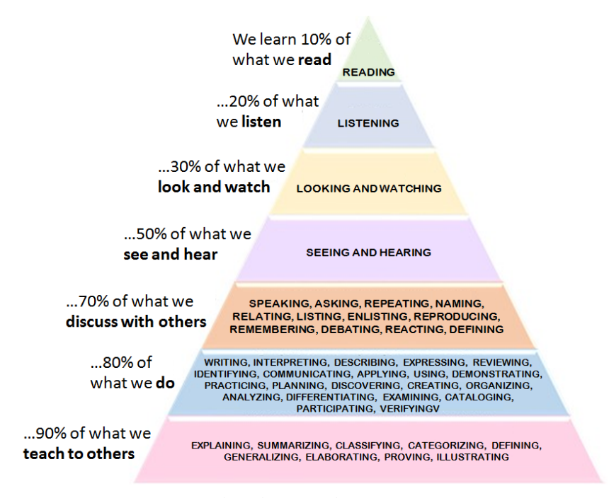
FIGURE 1 LEARNING PYRAMID