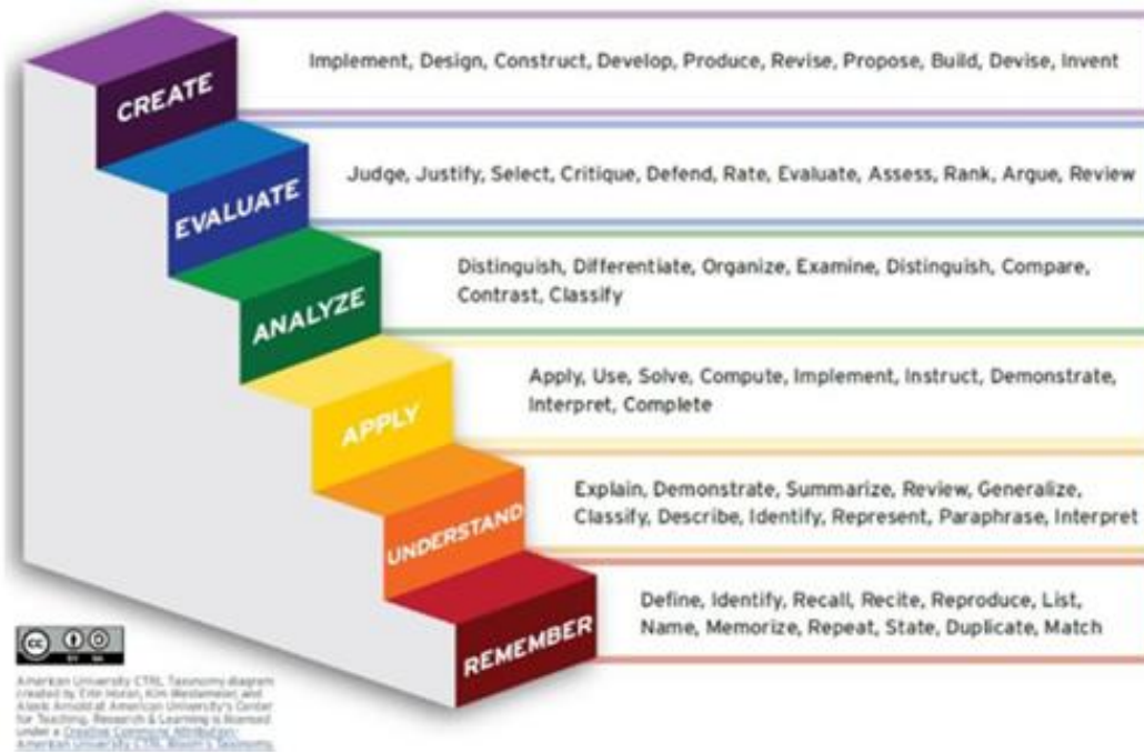
FIGURE 1 BLOOM'S TAXONOMY OF EDUCATIONAL OBJECTIVES