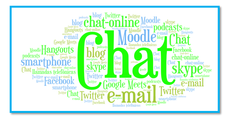
FIGURE 2 VARIETY OF TOOLS AND PLATFORMS USED IN THE SELECTED ARTICLES

The scientific evidence on platforms and technological tools is diverse, and there is confusion in the classification. Figure 2 shows the variety of tools and platforms used in the selected articles. According to these findings, it is necessary to classify them by teaching modality, a concept that coincides with (Aguilar Forero & Cifuentes Álvarez, 2019) who state that it is necessary to distinguish formal and non-formal education. Likewise, this classification will be necessary to guide university professors towards inclusive education since the student body requires specialized attention, being necessary to know technological tools to provide better attention using flexible didactic strategies and permanent motivation as stated by (Crisol-Moya et al., 2020), Without leaving aside the position of (García-Chitiva & Suárez-Guerrero, 2019), who state that it is necessary to implement teaching with collaborative tools, a position that coincides with (Basantes et al., 2018).