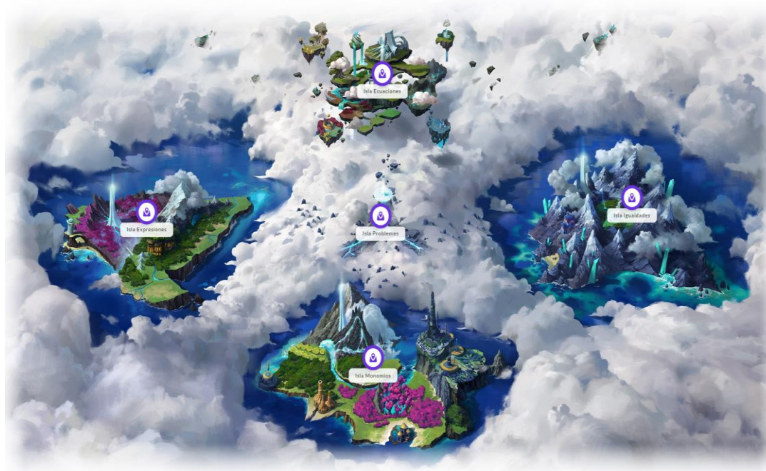
FIGURE 3 ALGEBRAIC ISLANDS MISSIONS

Note. Adapted from Algebraic Islands. Missions , by Classcraft Incl., 2021.