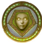
Random Selector of Students & Teams

Use these tools to gamify their lessons. Find out more.