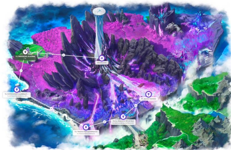
FIGURE 7 MISSION ISLAND EXPRESSIONS

Note. Adapted from Island Expressions , by Classcraft Incl., 2021, Classcraft ( https://app.classcraft.com/teacher/class/FcXADCSHMBRREAL9LG/quests/XLg5 )