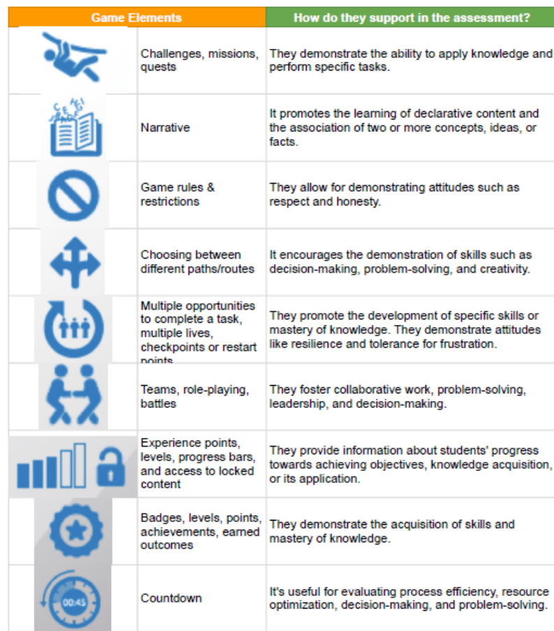
TABLE 1 SUPPORT OF GAME ELEMENTS TO THE EVALUATION

Note. adapted from “Gamification” (p. 13), by Observatorio de Innovación Educativa, 2016, EduTrends , 9.