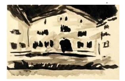
FIGURE 4 JOSEP ALBERS. BAVARIAN MOUNTAIN SCENE III. 1919 JOSEP ALBERS. MOUNTED GRID. CA. 1921