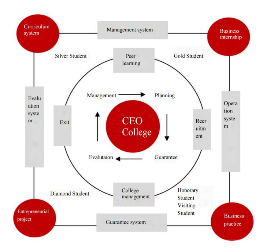
FIGURE 2 CEO COLLEGE'S STUDENT-RUN COLLEGE MODEL