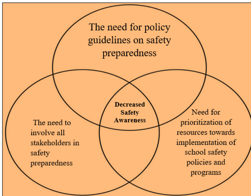
FIGURE 2 OVERVIEW OF THEMES

The figure above describes themes generated from the interviews carried out with the deputy principals. They included the need for policy guidelines on safety preparedness, the need to involve all stakeholders in safety preparedness, and the need to prioritize resources towards implementing school safety policies. These themes highlighted the areas that ought to be addressed in order to achieve sufficient awareness level of safety preparedness among teachers, otherwise schools will still suffer decreased safety awareness.