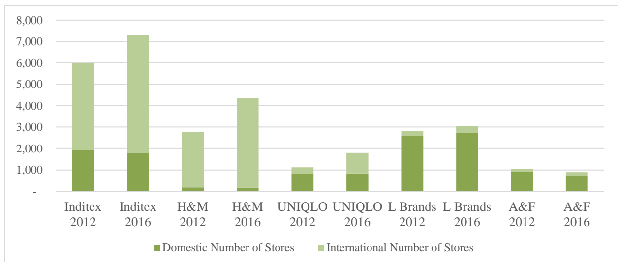
FIGURE 3 NUMBER OF STORES BY RETAILER FOR DOMESTIC AND INTERNATIONAL MARKETS, 2012 AND 2016