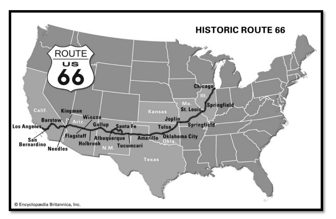
FIGURE 2 ROUTE MAP OF US ROUTE 66

Route 66 (see Figure 2) was officially removed from the United States Highway System in 1985 after much of it was replaced by the Interstate Highway System (Special Committee on U.S. Route Numbering (June 26, 1985). So, US Route 66 no longer serves as a major route for passengers or freight. However, it has adapted, in that portions of the highway have been designated a National Scenic Byway using the name "Historic Route 66" and are still drivable. Several states namely Illinois, Missouri, New Mexico, and Arizona have "adopted significant bypassed sections of the former US 66 into their state road networks as State Route 66" (U. S. Route 66, 2022).