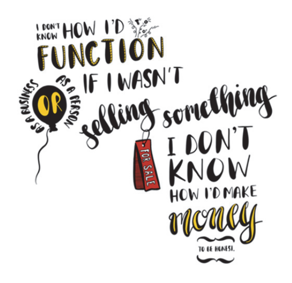
FIGURE 4 EXCERPT FROM A PRACTITIONER INTERVIEW CONDUCTED AS PART OF MY PHD RESEARCH