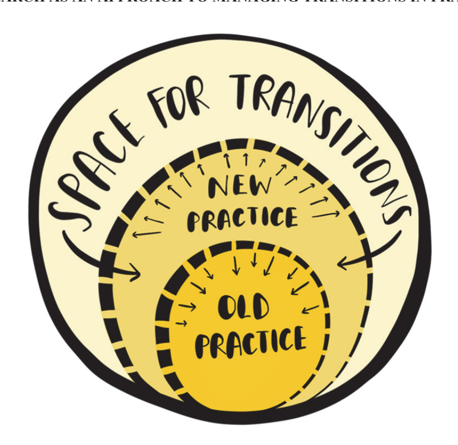
FIGURE 6 CURATING SPACE FOR TRANSITION DESIGN BY ENVELOPING THE OLD WITH THE NEW: THIS DRAFT MODELLING CONCEPT IS BEING EXPLORED WITHIN MY PHD RESEARCH AS AN APPROACH TO MANAGING TRANSITIONS IN PRACTICE

The funding balancing-act is currently being explored through Flourishing Fleurieu, where a number of local circular economy food and farming innovation projects form part of the vision for this community. The short-term aim is to open a food hub that is supported by region-specific social enterprises that can decrease the food hub's reliance on funding through grants. Curation has permitted space for this exploration to occur in the hopes that documenting this community-based work may also provide valuable insights into financing transitions.