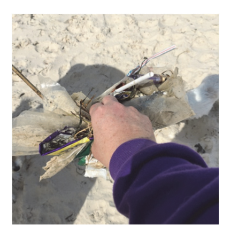
FIGURE 1 DAILY LITTER COLLECTION AS PART OF THE POLITICAL ACTION AGAINST WASTE AND THE LANDFILL WASTE PRODUCED DURING THE FIRST TWO YEARS OF MY ZERO WASTE TRANSITION

approach. Deeper engagement with problems and contexts through transformative and epistemic learning can create a kind of stickiness to theories presented in the literature which can forge pathways to action (Sterling, 2011). This shift from knowing into doing activates the ethico-political designer. This awakening can illuminate the sustainable potential in a brief, in turn loosening the double-bind causing action paralysis. It would appear that the rich experiences that formulated my transformation have sparked a mindset and posture shift which in turn facilitated the emergence of transition within my design practice. An ethico-political commitment fostered a praxis that catalysed a powerful practice-based transition—from designing 'greener things' towards designing against consumption through the practice of autonomous design and transition design.