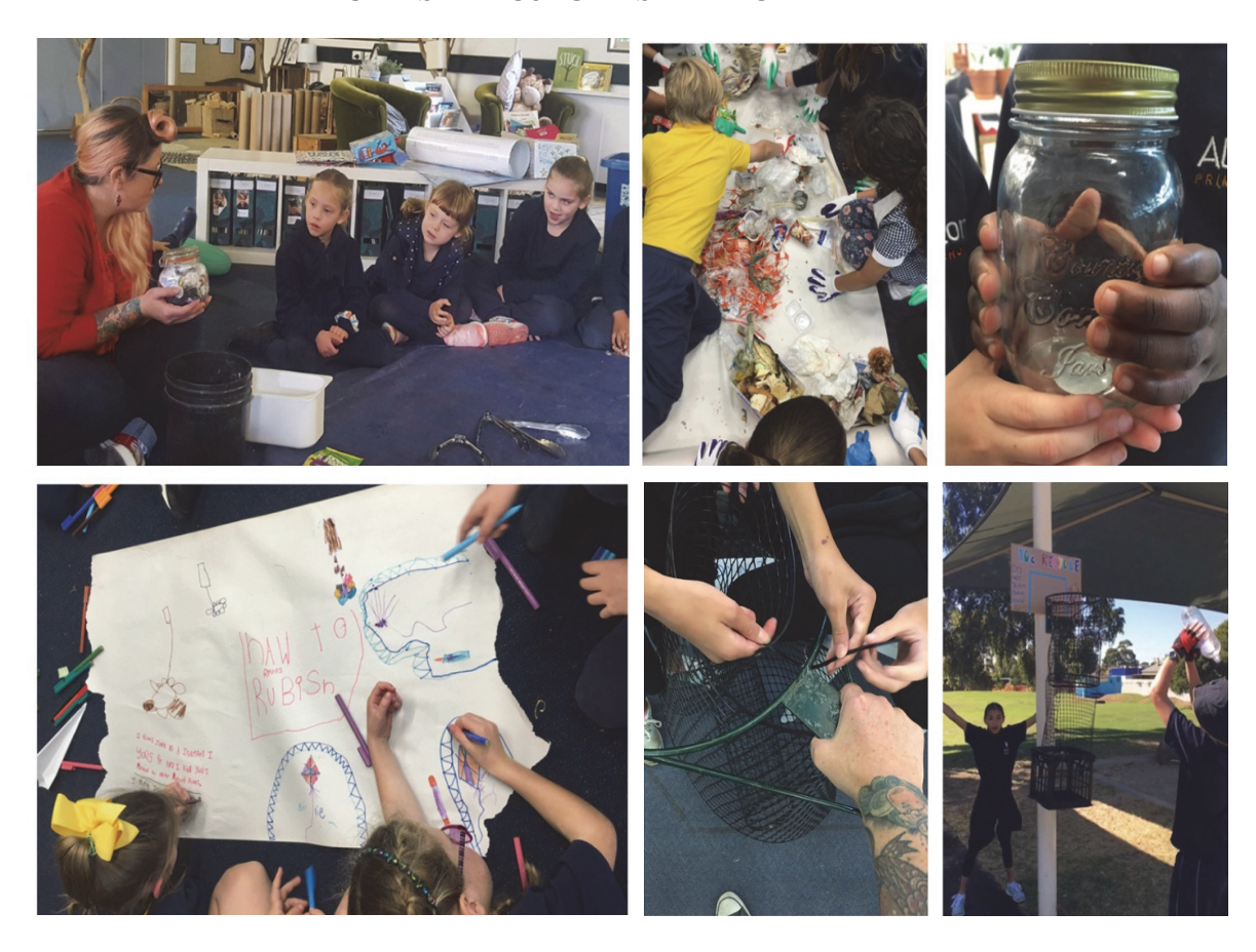
FIGURE 5 EXPERIENTIAL PROVOCATIONS AND EMERGENT PROJECTS, FROM THE RETHINK RUBBISH PROJECT AS PART OF MY PHD

One such project aims to shift students from consumers to contributors by building connections between the classroom, the garden and the canteen. Each class will plan, plant and prepare a meal for their peers, they will serve it to them and will later be in receipt of a meal that is planned, planted, prepared and served to them by another class group. The project draws connections back to the curriculum through traditional lessons such as maths, economics, biology and life sciences all of which are contextualised in the garden and kitchen, and in the process, students will also learn sustainable life skills around food production and preparation while practicing reciprocity, cooperation, planning and project management. Student participation in experiential sustainability learning nurtures values of