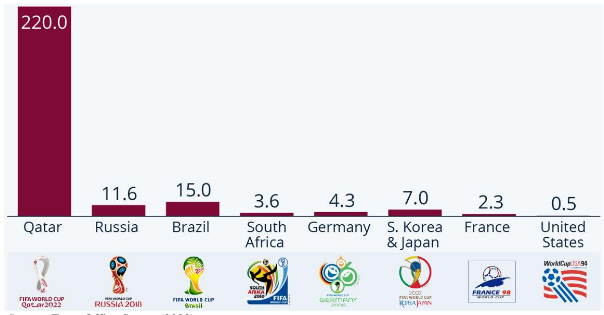
FIGURE 4 TOTAL COSTS OF HOSTING FIFA WORLD CUP TOURNAMENT IN BILLION US DOLLARS ((INCLUDING SPENDING OF STADIUMS AND OTHER INFRASTRUCTURE PROJECTS)

eight stadiums, which range from 40,000 to 80,000 seats, along with other infrastructure projects necessary to meet FIFA's high standards (Craig, 2022). This expenditure is 15 to 40 times greater than that of FIFA World Cup tournaments since 1994. In addition to building these stadiums, Qatar faced the challenge of a shortage of accommodation. As a small country—smaller than Montenegro, for example—and with limited tourist appeal, Qatar's hotel capacity was insufficient for the influx of fans. To address this, massive investments were made in luxury hotels, Bedouin-style tents, and cruise ships. In reference to Bataille's (1949/1991) concept of an "economy of waste," this can be seen as an example of extravagant spending and resource allocation.