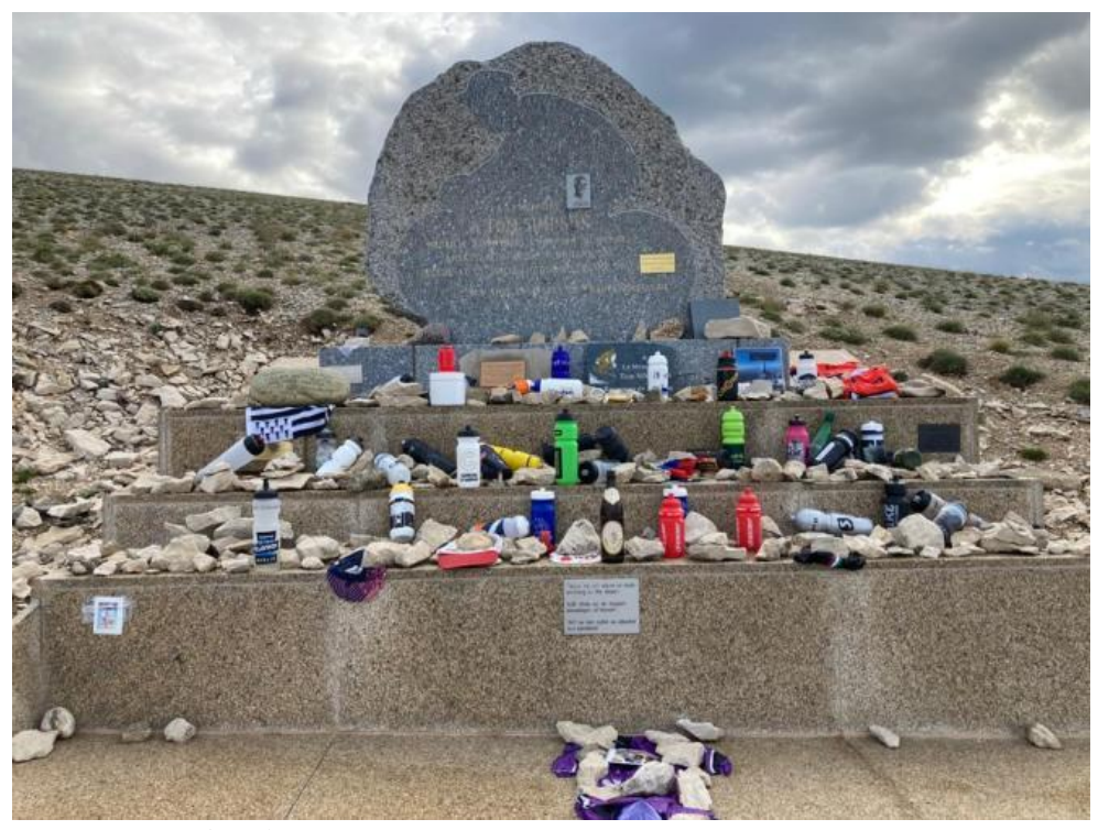
FIGURE 2 THE STELE IN HONOR OF TOM SIMPSON IN FRANCE: A "PLACE OF CULT" STILL ALIVE