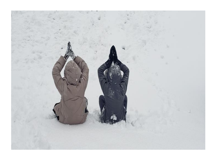
FIGURE 5 STUDENTS PRACTICING MINDFULNESS YOGA TECHNIQUES AT HOME