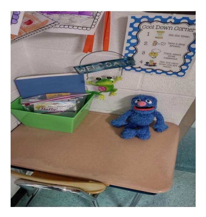
FIGURE 1 PHOTO OF THE CALM DOWN CORNER UTILIZED IN A FIRST GRADE CLASSROOM

A kindergarten classroom in a rural school district incorporated an adapted version of the 5-4-3-2-1 Senses activity. For this mindfulness activity, the students were asked to draw a picture of how they were feeling at that moment. The worksheet included "right now" statements for sight, hearing, touching, and smelling. They also had a question at the end where they had to circle how they felt at that particular moment. After the students completed their worksheet, the teacher met with them one-on-one to dictate their images.