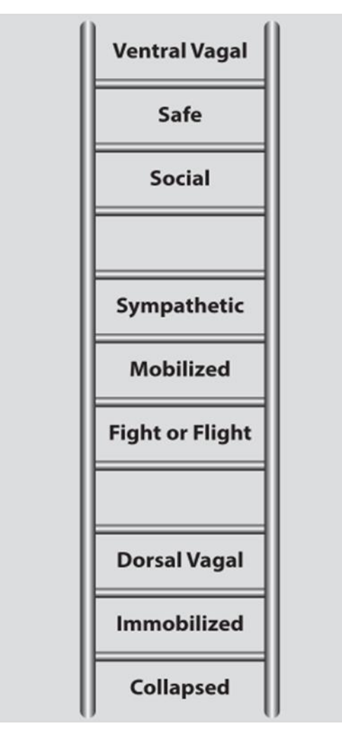
FIGURE 1 POLYVAGAL LADDER

The Polyvagal Ladder is a graphical depiction employed within the framework of the Polyvagal Theory to visually convey the hierarchical arrangement of the autonomic nervous system (ANS) and its impact on human beings' physiological and behavioral reactions. This ladder symbolizes three distinct states that humans shift between based on their perception of safety or threat. At the bottom of the ladder is the "immobilization" state, commonly referred to as the freeze response. A heightened perception of threat marks this state and manifests as bodily shutdown or paralysis, akin to the behavior observed in reptiles. In comparison, at the middle position on the ladder is the "mobilization" state, also known as the fight-or-flight response. Within this state, the body readies itself for action and responds to perceived threats by mobilizing energy for physical exertion or defensive reactions. Lastly, at the pinnacle is the "social engagement" state, the autonomic nervous system actively supports social behaviors, encompassing effective communication, cooperation, and empathy.