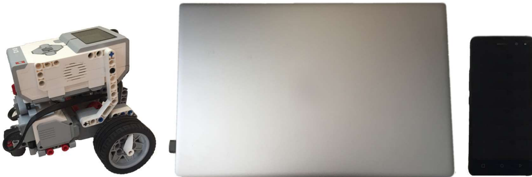
FIGURE 3 NEW SETUP: ROBOT, COMPUTER AND CELL PHONE

Additionally, a website can be developed with the course details combining mathematics and robotics education. This type of website will allow students to simulate the robot's path for students to test it in class and at home.