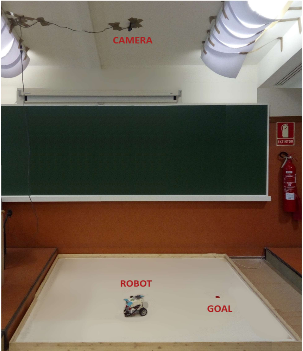
FIGURE 2 INITIAL EXPERIMENTAL SETUP

This setup, although very simple, has some economic and technological difficulties to be considered: