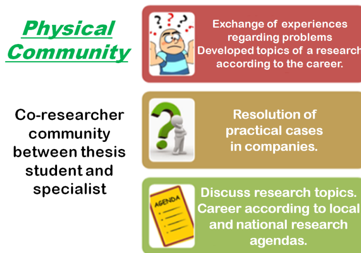
FIGURE 2 PHYSICAL COMMUNITY ACTIVITIES

The solution conceived is a “ Co-Research Community ” which is explained in Figures 2 and 3 below. At the prototype stage . This Co-Research Community will bring together members, advisors, undergraduate and graduate students for a research project.