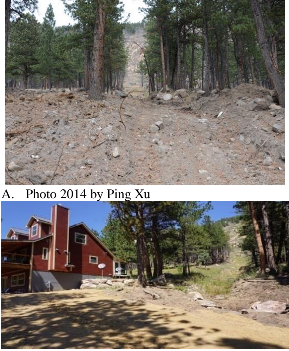
B. Photo 2017 by Ping Xu

Residents who choose to live in a site that has experienced or has the potential to have a debris flow are advised to consider facing potential danger and prepare to evacuate. During the rainy season, residents in high-impact areas should consider leaving. If they cannot vacate their home, they should pay attention to the weather forecast and follow any instructions or emergency evacuations administered to the public. The heavy precipitation elsewhere can also trigger a debris flow affecting downstream areas. Debris flow can create loud thunderous sounds when passing through canyons (Chavez, 2018). The debris flow event can last for several hours, and flows can reach over 100 mph, with walls of debris rising to 30 feet (King, 2018). Residents should not go outside to witness the debris flow, as debris flow can occur or change (Matjaž, 2003). Residents need to follow evacuation mandates and not return until they are officially safe.