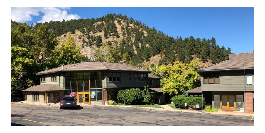
FIGURE 3 A NEW BUILDING RECONTRUCTED AT SAME SITE

the "like for like" insurance policy to build on the same site. Ignoring large-scale hazard impacts could lead the building to be destroyed in the next debris flow attack (Figure 3). Large-scale considerations are crucial in avoiding future failure (Steinitz, 2012).