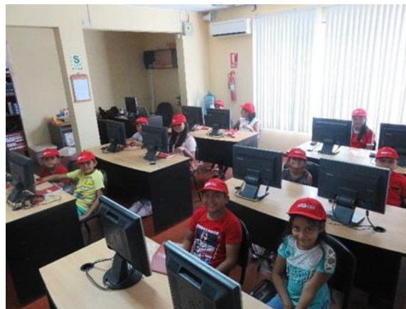
FIGURE 3 CHILDREN'S PROGRAM CDT TEMBLADERA